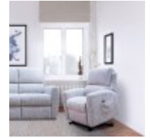
G Plan Hamilton Recliner Chair in Fabric