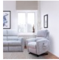
G Plan Hamilton Chair in Fabric