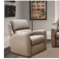
G Plan Hamilton Chair in Leather