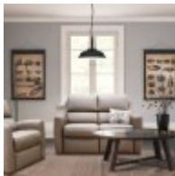
G Plan Hamilton 2 Seater in Leather

Width: 144.5cm Height: 104cm Depth: 95cm