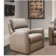
G Plan Hamilton Dual Elevate Chair in Leather

Width: 197.5cm Height: 104cm Depth: 95cm