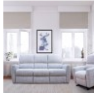
G Plan Hamilton 3 Seater Double Recliner in Fabric

Width: 144.5cm Height: 104cm Depth: 95cm