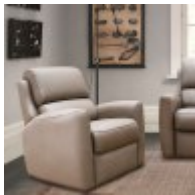
G Plan Hamilton Recliner Chair in Leather