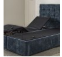
Adjust a Bed Lifestyle Base Set SuperKing