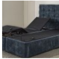
Adjust a Bed Lifestyle Base King