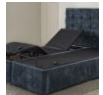
Adjust a Bed Lifestyle Base SuperKing